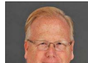
Metro-North tops list of priorities for new regional group