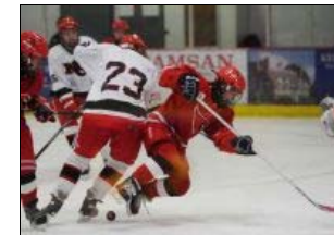
Big first period lifts New Canaan past Greenwich in girls hockey