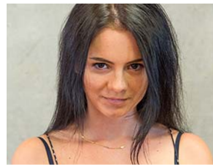
Stamford, CT Residents Are 'Battled' By New

But before these programs ascended to corporation status, they were just an idea in someone's mind.