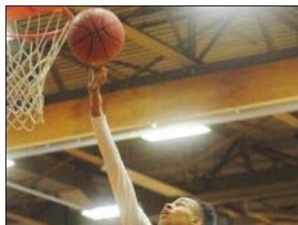
Stamford defeats Weston in Kuczo Tournament