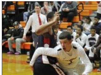
Stamford boys win Kuczo Memorial Tournament Championship