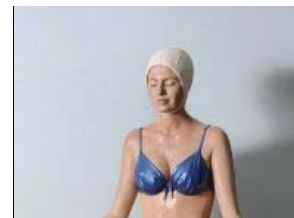
Real-life retrospective: Greenwich gallery explores contemporary realism