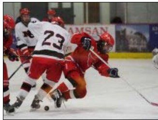
Big first period lifts New Canaan past Greenwich in girls hockey